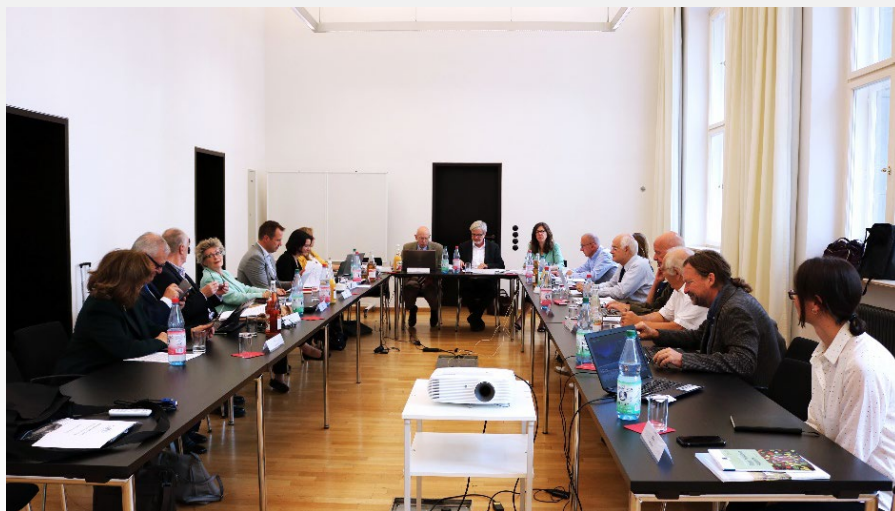
First Making Sense of Science for policy Working Group meeting, Brandenburg Academy, Berlin, September 2018